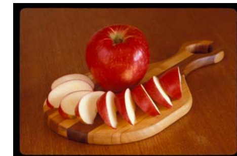
Honeycrisp — Explosively crisp and juicy. A world-class apple!

Honeycrisp™ is one of the University of Minnesota’s “best and most widely known, grown, popular, and savored apples.” Yet, while eating a Honeycrisp is a special treat, it is just one of many tasty varieties you can experience at Maiden Rock Apples. Check the chart on page 3 for other varieties and their approximate harvest dates.