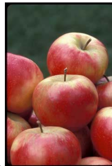
Honeycrisp — Explosively crisp and juicy!

Their exceptionally crisp and juicy texture is one factor that distinguishes the Honeycrisp Apple. “Bite into the cream-colored flesh and the large cells explode with juice in your mouth...”