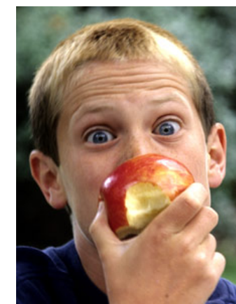
“Crunch into Zestar!™”

Their exceptionally crisp and juicy texture is one factor that distinguishes the Honeycrisp Apple. “Bite into the cream-colored flesh and the large cells explode with juice in your mouth...”