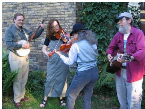
Mill City Serenaders play for the Barn Dance in September.

Delicious apple brats & barbecue beef sandwiches as well as other treats are available for purchase or bring a picnic & sit midst the apple trees! Eating starts at 6:00