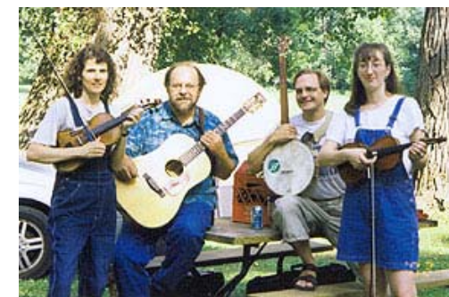
All dances are taught and led by a caller accompanied by a string band.

or with friends! All ages are welcome — bring the kids. Music starts at 7:00 pm! Delicious apple brats and barbecue beef sandwiches as well as other treats are avail- able for purchase or bring your own picnic! Eating starts at 6:00 pm! apple brats and