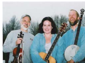
Rush River Ramblers play for the June and August Barn Dances.

Delicious barbecue beef and pork sandwiches as well as other treats are available for purchase or bring a picnic and sit midst the apple trees!